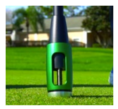
TOUGH, STEEL CONSTRUCTION

Tested and developed with Professional Greenskeepers, our unique tool is a step-change in how to help preserve green conditions and a great way to show support for greens maintenance teams.