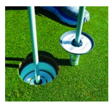
A PROFESSIONAL & LEGAL BALL RETRIEVAL SOLUTION