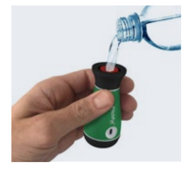
REFILLABLE WATER SPRAY