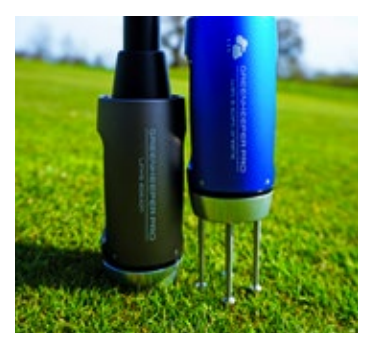
PATENTED, REPAIRTEC™ MECHANISM