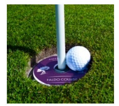
USE TO MAKE SHALLOW COVID-SAFE HOLES