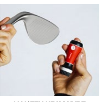
MOISTEN HEAVY DIRT