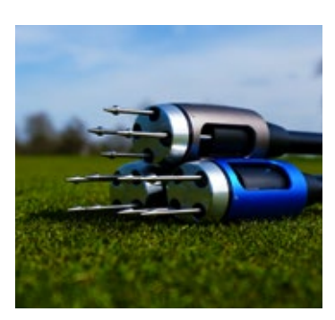
3 MODELS FOR DIFFERENT COURSE CONDITIONS