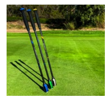
UNIQUE, LONG-HANDLED DESIGN