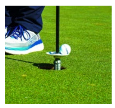
SPEED UP PLAY BY LEAVING THE FLAGSTICK IN THE HOLE

The Pickup Promo edition also enables exclusive in-hole branding, ideal for event sponsors.